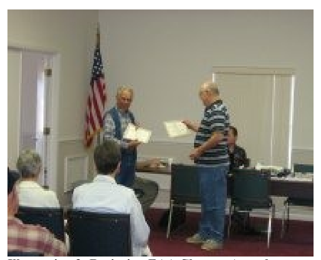
Illustration 3: Recieving EAA Chapter Awards

Our Club Officers recieved thier well deserved EAA Chapter awards for thier services in 2009.