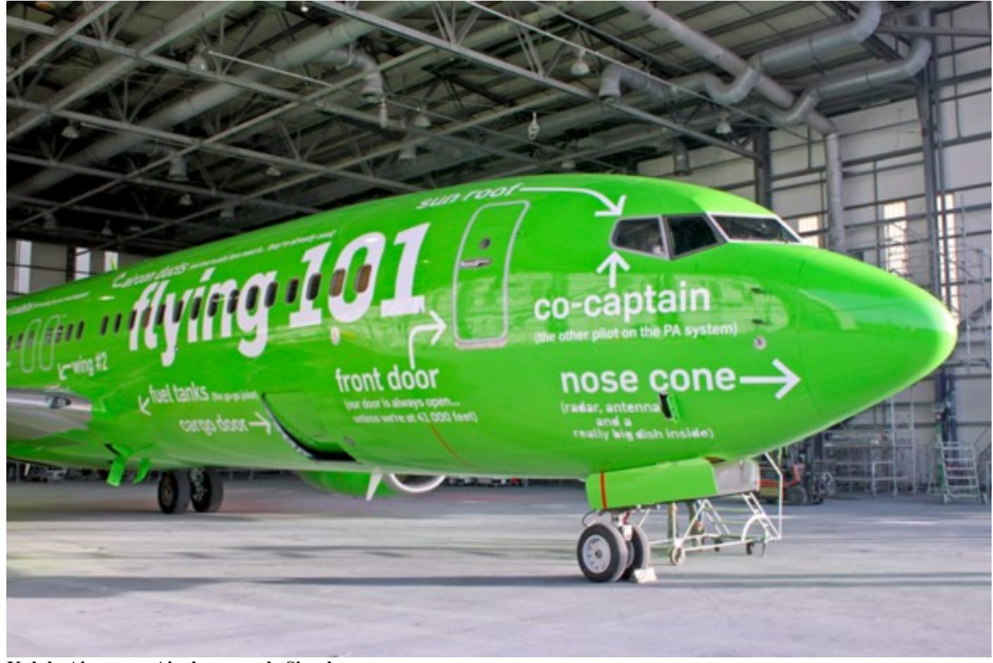
Kulula Airways - Airplanes made Simple